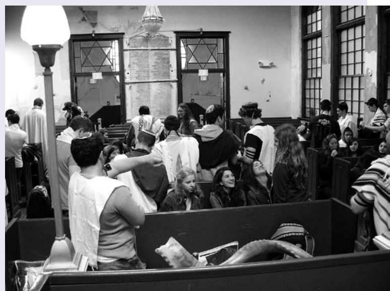
Students from Solomon Schecter of Westchester, NY preparing for prayer