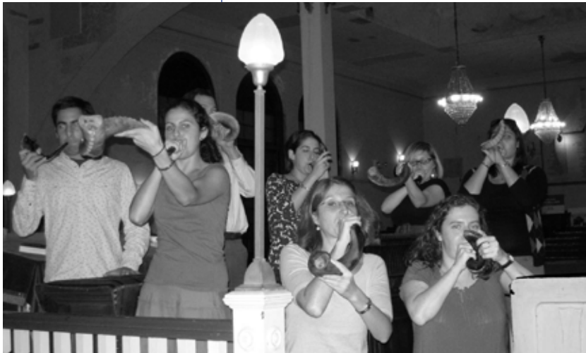
Havurah on the Hill Shofar blowing workshop